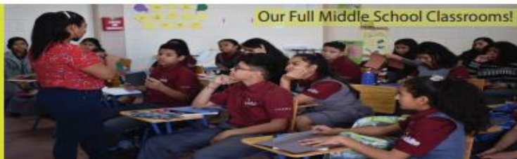
Our Full Middle School Classrooms!

How often in our lives is there something we are longing and praying for, and it just seems like it is never going to happen? Such was the case for us here at Jubilee with the desire to start our Middle School. Now that we have the first few months of Middle School successfully under our belts, we can see how this time of waiting has really been a time of preparation. During the last few years, God has strengthened our leadership, and grown us in many ways that are now serving us well.