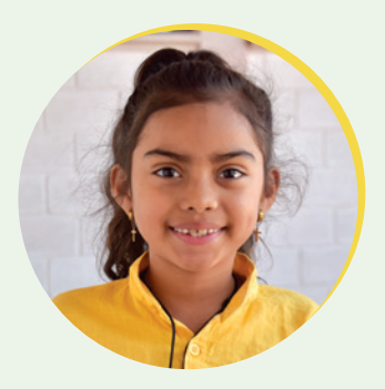
Seeking God means to keep our faith fixed on Jesus Christ."

This year our theme is "I Will Seek You" based on our theme verse Jeremiah 29:13. Four of our fourth graders reflect on what it means for them to seek the Lord: