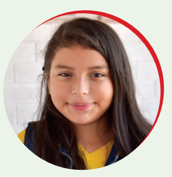
G To seek God means to obey His commands."