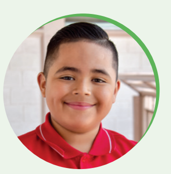
When we seek God we find peace and love."